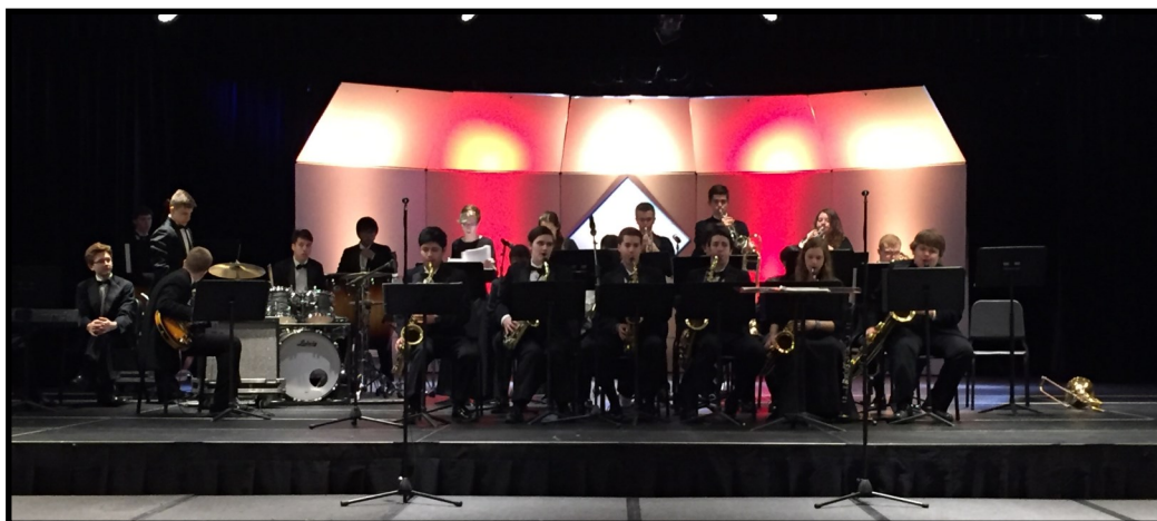
Above: Lake Braddock Jazz Ensemble performs at Disney World