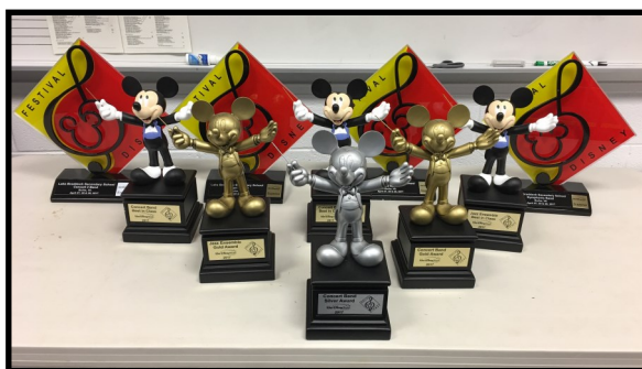
Left: Lake Braddock musicians received many awards at Disney World

To view more pictures from the Disney trip, please visit https://www.dropbox.com/sh/vvxct28v7ql8lz8/AACtm2RY2r_UiNFZ-e8nqZnEa?dl=0 .